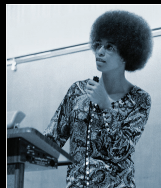
Angela Davis Speaking at UCI, October 1969.

theoretical models to analyze literature and art, and general systems of information, including history, language, and political relations. With the recent emergence of the Theory and Culture Ph.D. program, the Critical Theory Emphasis promotes rigorous critical engagements with symbolic categories, particularly gender and ethnicity.