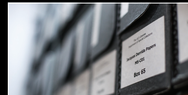
Jacques Derrida Papers located in the UCI Libraries' Special Collections and Archives.

Theorists who have taught as members of the Critical Theory Emphasis include Étienne Balibar, Jacques Derrida, Wolfgang Iser, Jean-François Lyotard, J. Hillis Miller, and Gayatri Chakravorty Spivak. UC Irvine's distinct commitment to theory, reflected in the CTE, the Critical Theory Institute, the Critical Theory Archive, and individual departments, defines the distinguished character of the Arts, Humanities, and Social Sciences at UCI, and contributes to its international reputation for scholarly innovation.